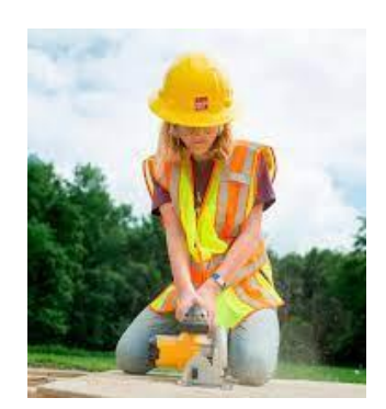
Tools - Hand and Power